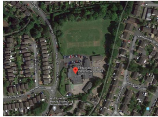
A map of Etching Hill